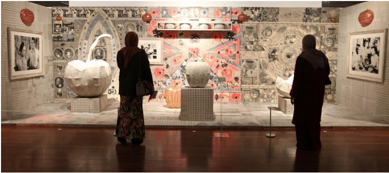
Zulkifli Yusoff's work Merdeka 57 (mixed media, 2009) exhibited at the National Art Gallery in KL in 2017.

The Venice Art Biennale, first held in 1895, is the original biennale upon which others in the world have been modeled.